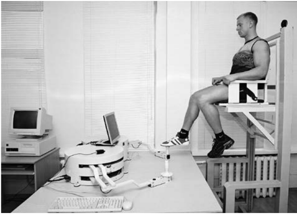
Fig. 1. DPA-1 equipment and subject position during the tests

of the start zone (standard task) or randomly on the left, right, and in front of the start zone (variable task). The standard and variable tasks included 15 repetitions and were performed with one foot without stopping; then, after a 2-min break, the same tasks were performed with the other foot.